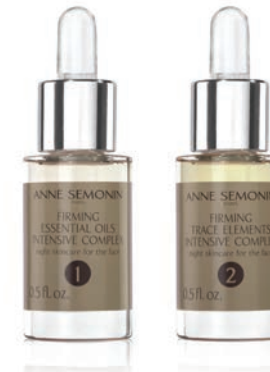
Toning and Rejuvenating

A reviving, restorative treatment to delay the signs of aging and improve elasticity to leave skin feeling firmer and fully nourished.