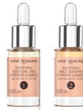
Calming and Hydrating

A gently restorative, calming treatment that rapidly reduces irritation and redness. It helps rebalance blood circulation for a rested skin.