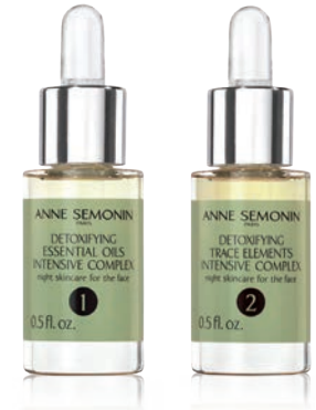
Draining and Anti-Oxidant

A strong antioxidant blend of actives to precisely target the urban environment and lifestyle. Protects from free radicals, reinforces skin self-defense to delay the premature aging.