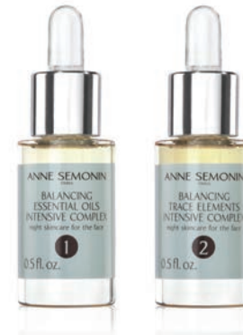
Regulating and Astringent

A powerful blend of essential oils and trace elements to clarify and brighten imbalanced skin.